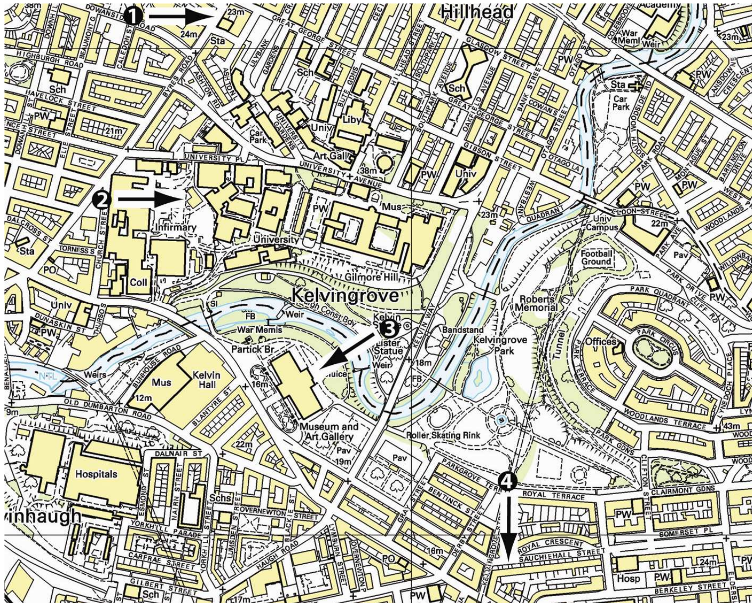
Map of University area showing locations of: 1) Hillhead Subway Station; 2) Western Infirmary Lecture Theatre (WILT); 3) Kelvingrove Art Gallery & Museum (arrow points to Lower Ground floor entrance); 4) Mother India restaurant